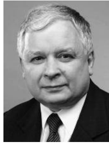
Polish President Lech Kaczyński

On April 10, 2010, a plane carrying Polish President Lech Kaczyński and his wife Maria along with 94 others crashed while coming in to land in the dense fog near a Russian airport near