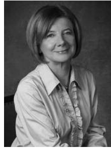
First Lady Maria Kaczyńska

later he got involved in activities of the Free Trade Unions. In August 1980 he was appointed as an adviser to the Gdańsk Inter-Enterprise Strike Committee in Gdańsk Shipyard. He is the author of several provisions contained in the Gdańsk Agreement as well as of a section of the statutes of the Solidarność trade union concerning strikes, trade sections and collective agreements.