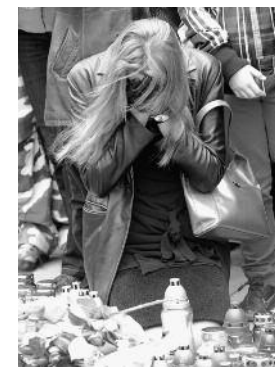
A nation in mourning.

There are also effects of this tragic event nobody could expect. In a matter of days, Katyń has become a place recognized world-wide and many people have learned why the collective memory of the Katyń massacre casts a deep shadow on Polish