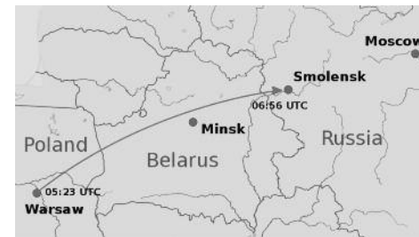
Path of the ill-fated flight.

Nobody can measure today all the consequences of this catastrophe. Parliamentary opposition, the armed forces and the newly