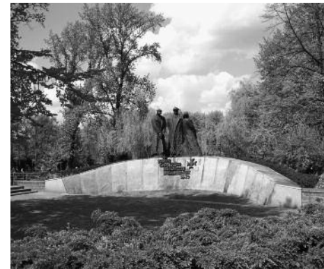
Katyn Memorial in Katowice.

lawyers, engineers, and teachers, more than 100 writers and journalists, as well as about 200 pilots.