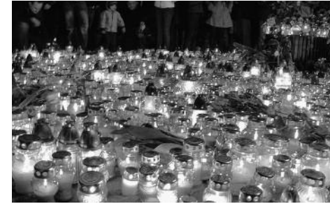
Thousands of candles were lit in front of the Presidential Palace.

brought by planes to Poland, they were buried with all the honors in state funerals across the country. The central commemoration of the dead took place in Warsaw's Piłsudski Square and was