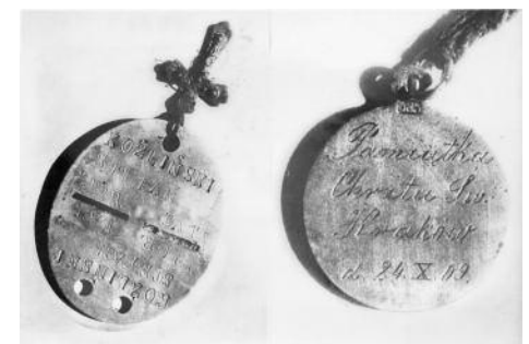
Polish medallions recovered from Katyń.

and Secret Police (NKVD), recommended to Stalin and the Politburo that 25,700 prisoners be executed in order to deprive the future state of Poland a large part of its military and educated talent. The killings took place at the Katyń forest itself, in camps, in jails, and wherever the Soviets were holding these Poles on the death lists.