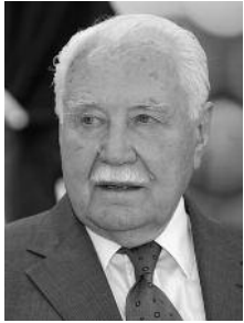
Ryszard Kaczorowski Last Polish President in Exile

Kaczorowski was born November 26, 1919, in Białystok. Captured and exiled by the Soviets at the beginning of the Second World War, he joined General Władysław Anders' Army. After the war he remained in Great Britain as a member of the