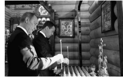
Russian President & Prime Minister lighting candles for the dead.

However, nothing indicates that democracy in Poland is in any imminent danger. All government offices are functioning normal-