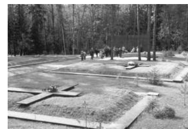
Mass graves at Katyn.

In 1941, the Polish Government in Exile in Great Britain signed an agreement with the Soviets to create a Polish