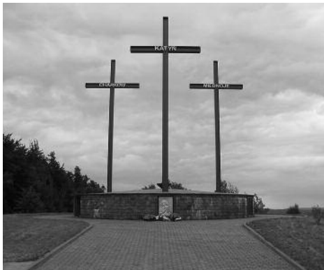
Crosses at Katyń.

between the two countries. On September 1st Germany invaded Poland from the south, west and north and on